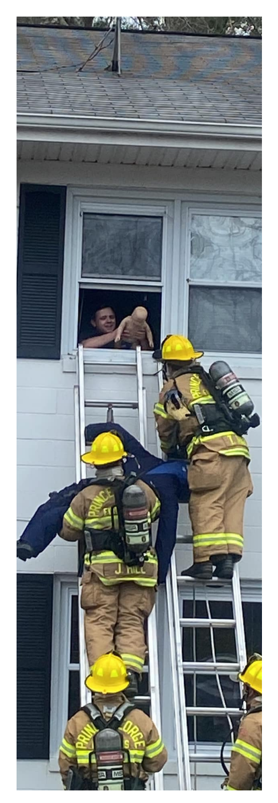
In an emergency, DIAL 911.